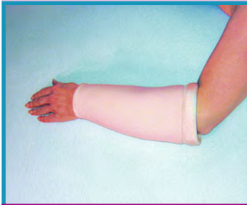
DERMASAVER FOREARM TUBE